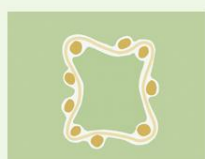
Single looped playful pathway