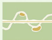
Crisscross loop with rail-to-trail playful pathway