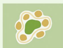
Compact looped playful pathway