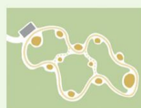
Multi-looped playful pathway