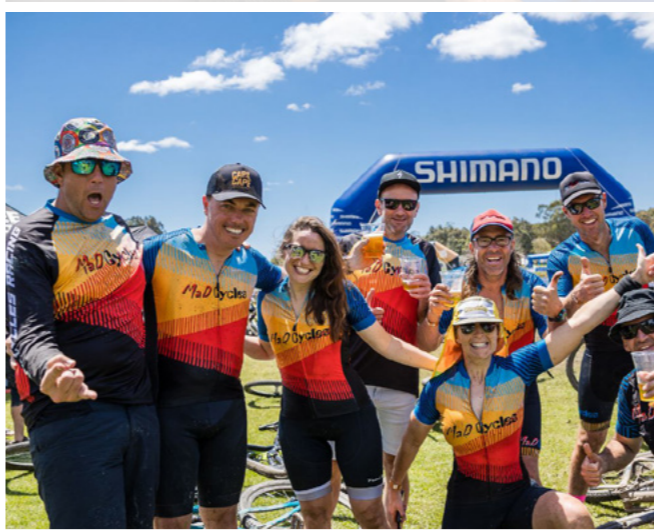
C2C participants celebrating after a weekend of mountain biking in the region

The Shire of Nannup is excited to announce the Women on Wheels project, funded by the Department of Local Government, Sport and Cultural Industries Active Regional Communities Initiative Grant program. This initiative, in partnership with the Nannup Mountain Bike Club, aims to increase the number of locals who ride regularly, with a special focus on encouraging female participation. It offers guided rides, with coaching and skill sessions, to build confidence and improve skills.