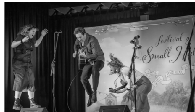
The Town Hall coming alive during the Festival of Small Halls

Carols by Torchlight will complete the 2024 event year before Family Fun Day and Australia Day kick off the 2025 calendar. The Shire of Nannup was successful in securing funding through the National Australia Day Council (NADC) Community Events Grant Program and will once again have an outdoor movie screening in partnership with the Nannup Community Cinema. The 2025 movie will be The Sapphires .