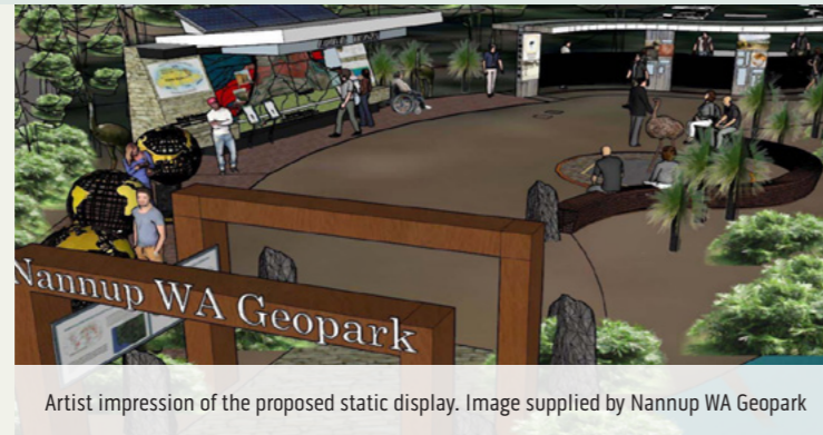
Artist impression of the proposed static display.

Along with these accomplishments, key members from the group attended the 8th Asia Pacific Geoparks Conference