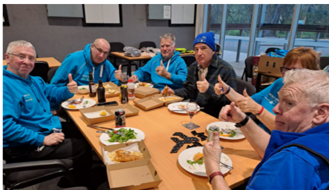
LifeCycle for Canteen participants savouring a well-deserved meal after their long ride